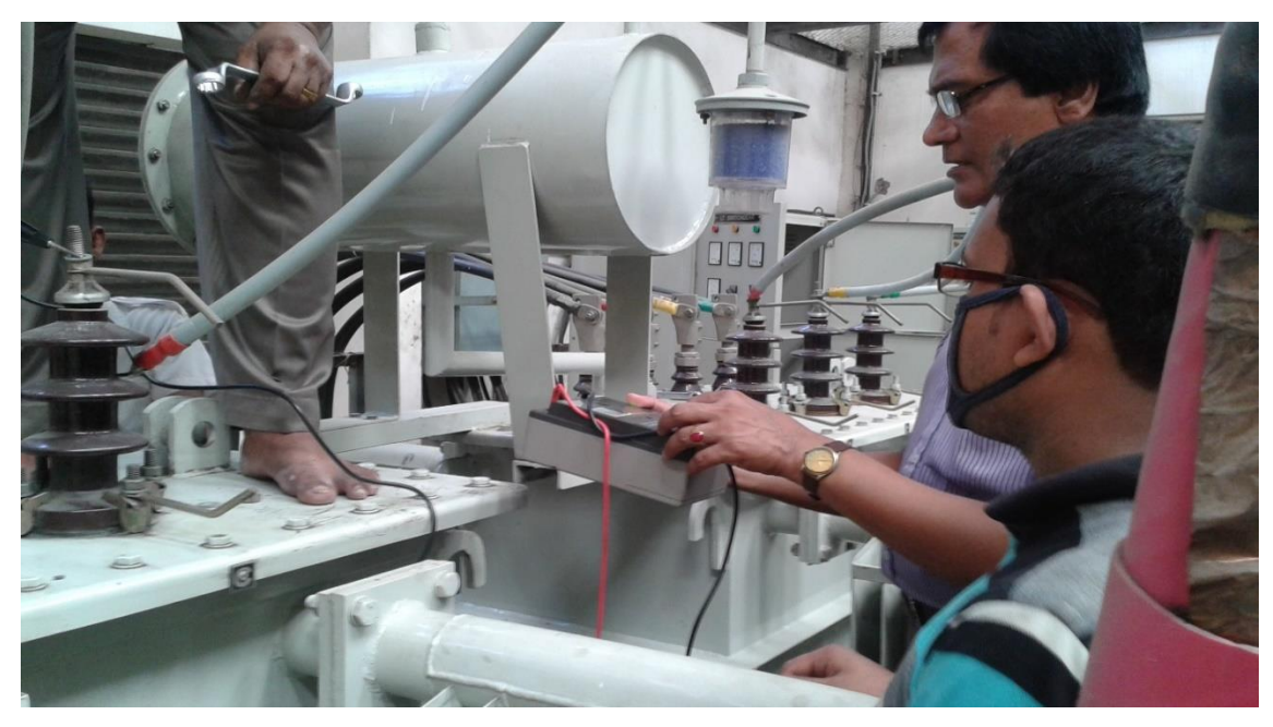
Electrical Inspection Service At HKD International, CEPZ, Chattogram

Investigation/survey of electrical incidence, fire, etc.